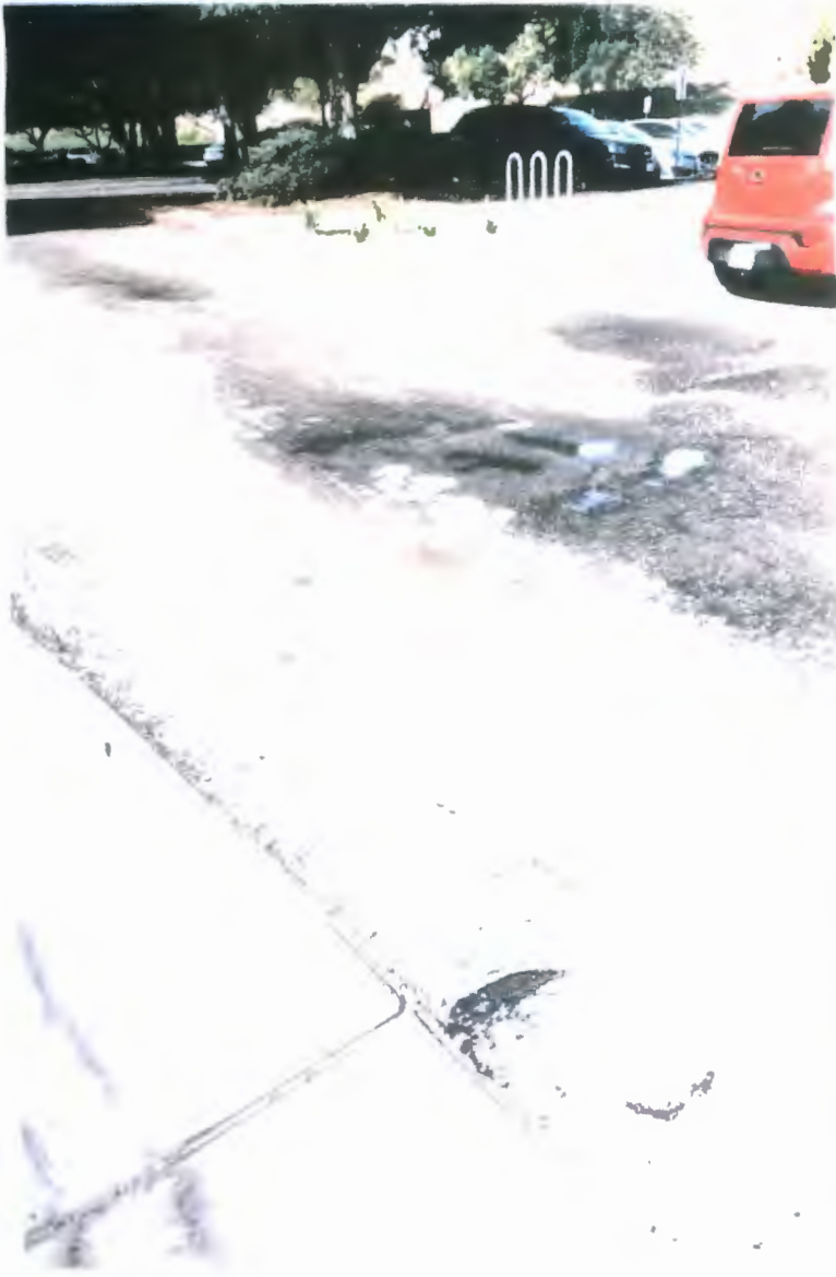
County Circle Drive Parking Lot ATTACHMENT #1