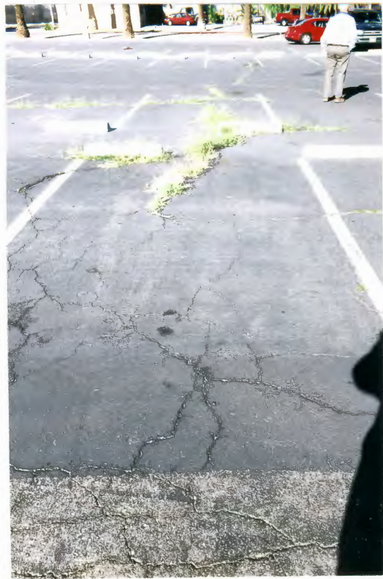
County Circle Drive Parking Lot ATTACHMENT #1