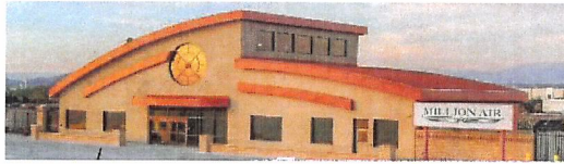
MIPAA's terminal at the March Air Reserve Base

The March Inland Port Airport Authority (MIPAA) was formed by the JPA in 1996 for the purpose of creating a public use airport on the March Air Reserve Base. MIPAA shares aviation facilities with the March Air Reserve Base including a staffed control tower, taxiways, nav aids, runways, and maintenance facilities. The runway is 13,300 feet long.